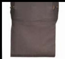
Optional privacy flap is available