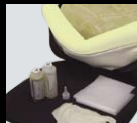
Individually molded insert produced in minutes with user seated in back Optional high stretch cover available