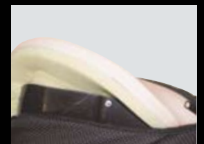
Laminate of .5" high resilient foam and .625" Visco Foam Available on Invacare Matrix PB and Elite Backs Molded foam is not available on Invacare Matrix PB Back with this option