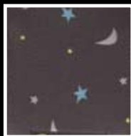
Kid*ab*ra fabric optional