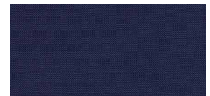
SILVERTEX SAPPHIRE BLUE