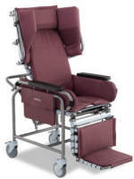
Centric Positioning Wheelchair