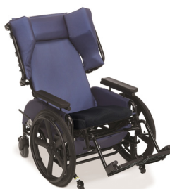
Latitude Rehab Wheelchair