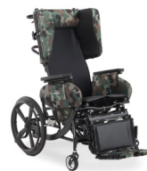
Synthesis Positioning Wheelchair Synthesis Transport Wheelchair

250 lbs. weight capacity Up to 25° Tilt Up to 45° Recline