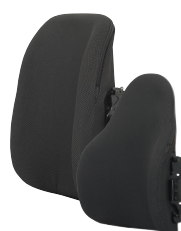
PB & PB Deep