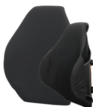
Elite & Elite Deep