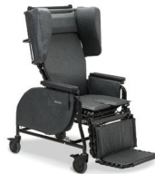
Midline Positioning Wheelchair