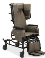
Elite Positioning Wheelchair Elite Tilt Wheelchair