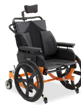
Encore Pedal Wheelchair with Dynamic Rocking feature