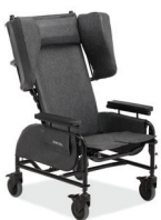
Sashay Pedal Wheelchair