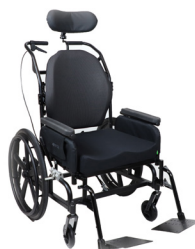
Comfort Rehab Wheelchair