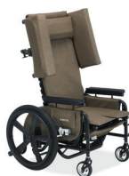
Latitude Pedal Wheelchair with Dynamic Rocking Feature