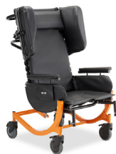
Encore Pedal Wheelchair