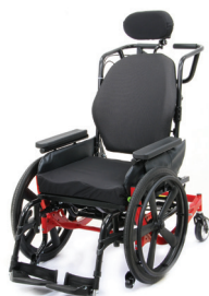
Encore Rehab Wheelchair