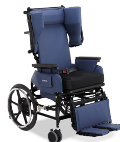
Elite Rehab Wheelchair