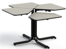
BFL-4-(4/1) 4-Person Adjustable Table