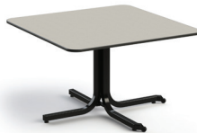
BFL-4-(42x42) 2-Person Adjustable Table