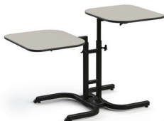
BFL-2-(1/1) 2-Person Adjustable Table