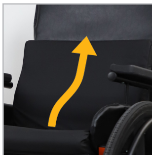
Lumbar support for spinal alignment and improved posture