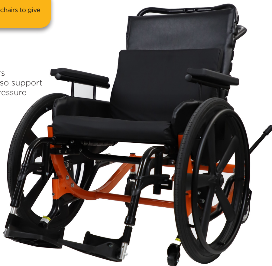
Shown on the Encore Pedal Wheelchair