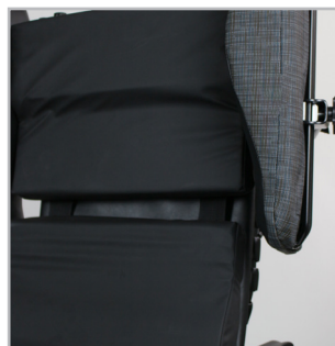
Works in harmony with Comfort Tension Seating ®