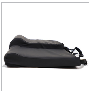
Low profile and unobtrusive cushion