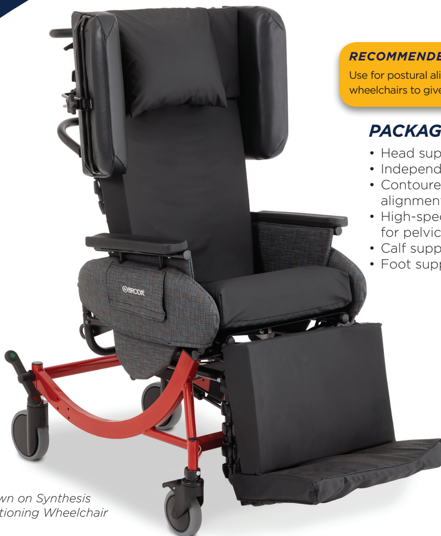
Shown on Synthesis Positioning Wheelchair