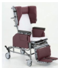
Excellent for your most difficult to seat residents