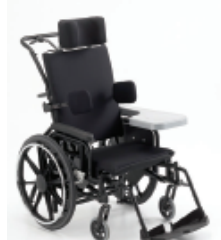
Excellent for fall prevention