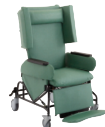
Ideal for multiple users and hospital environments