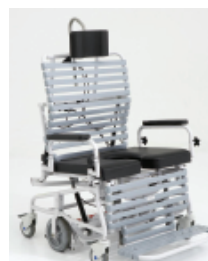
Available with transport seat