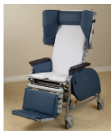
Multi-positioning on a budget