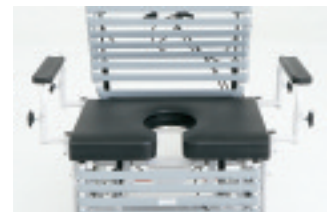
Open front commode seat facilitates peri cleaning

Width adjustable armrests accommodate widths up to 33"