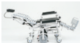
65° Back recline

Width adjustable armrests accommodate widths up to 33"