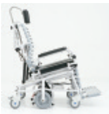
14° Posterior tilt