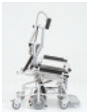
8° Anterior tilt